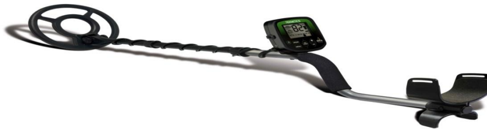
Figure 2: A metal detector for scanning [5].