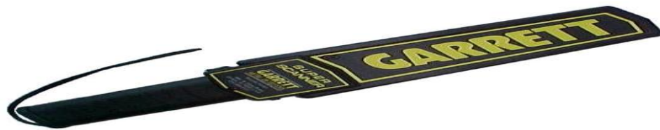
Figure 1: A metal detector for scanning [2].