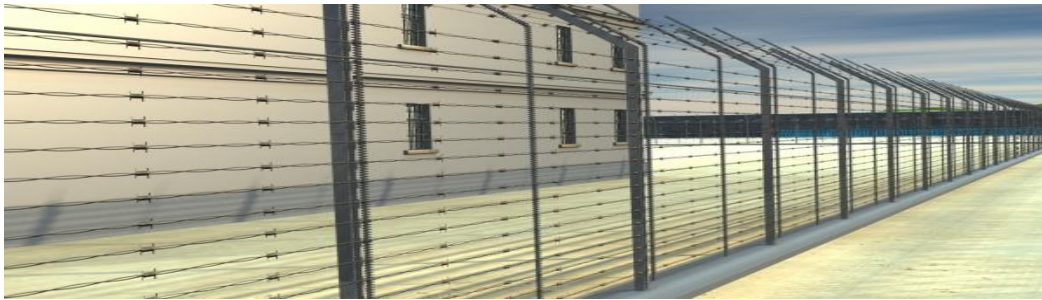
Figure 5: Taut wire fence