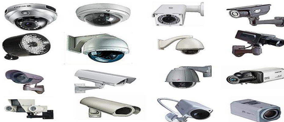
Figure 3: Some cctvs and ip cameras for monitoring [12,13].

In addition to the system itself, security alarms are often coupled with a monitoring service. In the event of an alarm, the premises control unit contacts a central monitoring station. Operators at the station see the signal and take appropriate action, such as contacting property owners, notifying police, or dispatching private security forces. Such signals may be transmitted via dedicated alarm circuits, telephone lines, or Internet. Alarm connection and monitoring Depending upon the application, the alarm output may be local, remote or a combination. Local alarms do not include monitoring, though may include indoor and/or outdoor sounders (e.g.