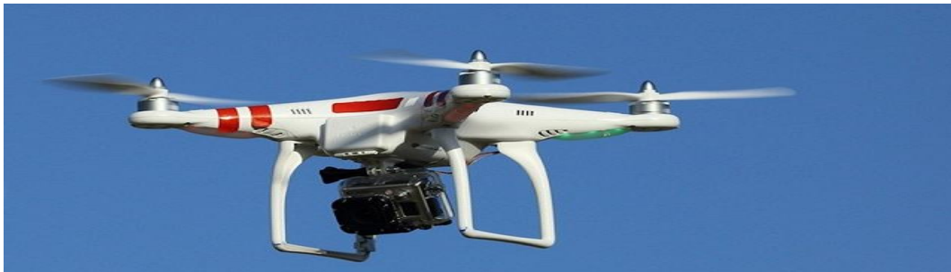
Figure 4: A drone with internet protocol camera for monitoring [33,36].

Aerial surveillance of large areas is possible with low-cost UAS. Surveillance applications include livestock monitoring, wildfire mapping, pipeline security, home security, road patrol and antipiracy. UAVs in commercial aerial surveillance is expanding with the advent of automated object detection. Many police departments in India have procured drones for law and order and aerial surveillance. UAVs have been used for domestic police work in Canada and the United States. A dozen US police forces had applied for UAV permits by March 2013. In 2013, the Seattle Police Department's plan to deploy UAVs was scrapped after protests. UAVs have been used by U.S. Customs and Border Protection since 2005 with plans to use armed drones [35,36]. The FBI stated in 2013 that they use UAVs for "surveillance". In 2014, it was reported that five English police forces had obtained or operated UAVs for observation Merseyside police caught a car thief with a UAV in 2010 [37].