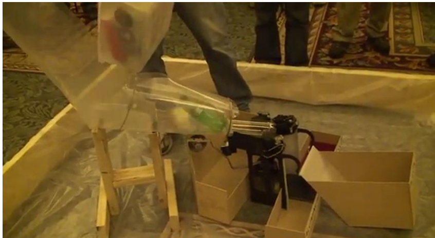
Fig.3: Autonomous Material Waste Sorter

This is made from cardboard and expanded PVC for minimal weight. A 9400 rpm DC motor was gear boxed to spin the AWS at 900 rpm. A sensor detects magnets on each flap to determine loaded material to be sorted. A servo controlled by a microprocessor loads each material one by one from the fully loaded hopper.