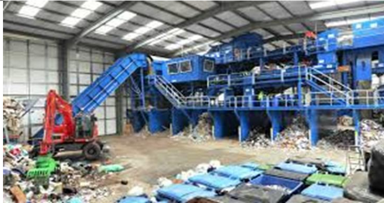
Fig. 1: Stadler Sorting Plant

For this plant, general waste is fed into the plant through a squeezer to break the waste down for transportation of the waste from the beginning to the end by a conveyor belt. A central monitoring system monitors the waste throughout the plant. A trommel screen machine rotates the waste to create spacing within them. The organic fractions machine separates the organic waste and non-organic waste, a ballistic separator machine shakes up waste to differentiate the heavy once from the lighter once. The rolling fractions take the waste up to the PET-PEHD machine which mixes the plastics and the waste is passed on to the quality control. Lighter waste like paper are blown up by air and then passed on for bailing. On the other hand, the residue is compressed and bailed for storage [6].