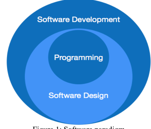
Figure 1: Software paradigm