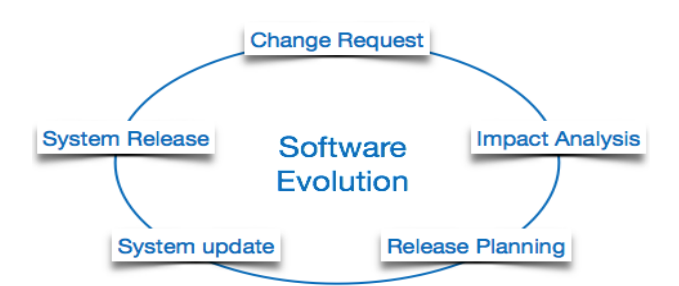
Figure 2: Software Evolution