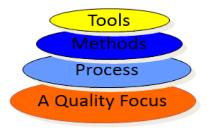
Figure 3: Flow chart of processing.