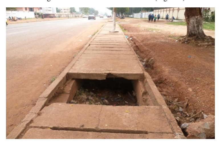
Photo 4: discharge channel wastewater from SAVEX (Source: ML Koyassambia, 2010)

The image below shows the discharge channel wastewater from Savex (Figure 4)