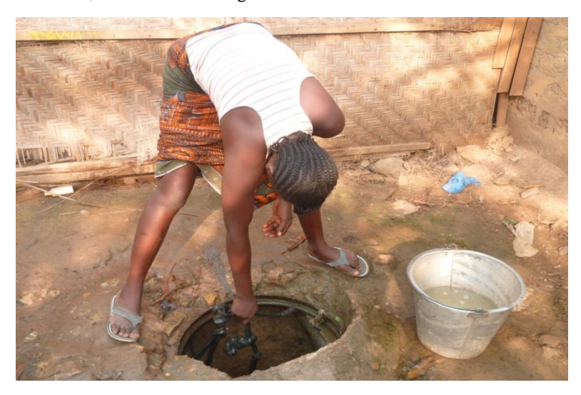
Photo 3: Water color and without the disorder

The wells in this area are in circular shape, surmounted by a drum cut in half and build a curb which consists of a few pieces of scrap metal recovery that is consolidated with the earth. This artisanal construction does not guarantee a true seal the wells, as shown in this figure below.