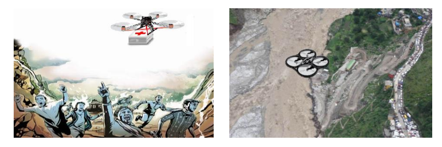
Figure 5. Drone for rescue and rehabilitation.