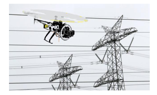
Figure6. Surveillance Drone over power line masts.

In order to cater the increasing energy requirement another important option is nuclear energy which is rapidly adopted by growing countries all over the world. It is always critical to manage nuclear power plants and nuclear radiations. Because drones are able to fly at low altitudes, they can measure radiation in greater detail than a helicopter or other aircraft. GIS is a potential tool for planning and monitoring both conventional and non-conventional power generation resources. Sophisticated spatial analysis tools when integrated with real time monitoring methods are used for determining optimum generation potential, formulating what-if scenarios, studying environmental impact, and managing facility assets. Geo-database developed with continuous inflow of data is key component for maintaining and managing accurate transmission asset data such as substations, lines, and associated structures.