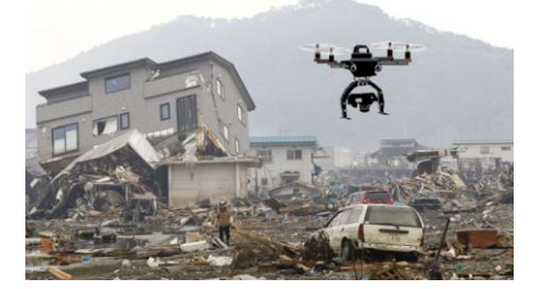
Figure4. Drone over a disaster area.

GIS can be a very useful tool to complement conventional methods involved in Disaster Management Mitigation of natural disaster management can be successful only when detailed knowledge is obtained about the expected frequency, character, and magnitude of hazard events in an area [12] [13]. GIS when integrated with UAV provide layers of information on various themes to enable the managers to take the most appropriate decisions under the given circumstances at run time.