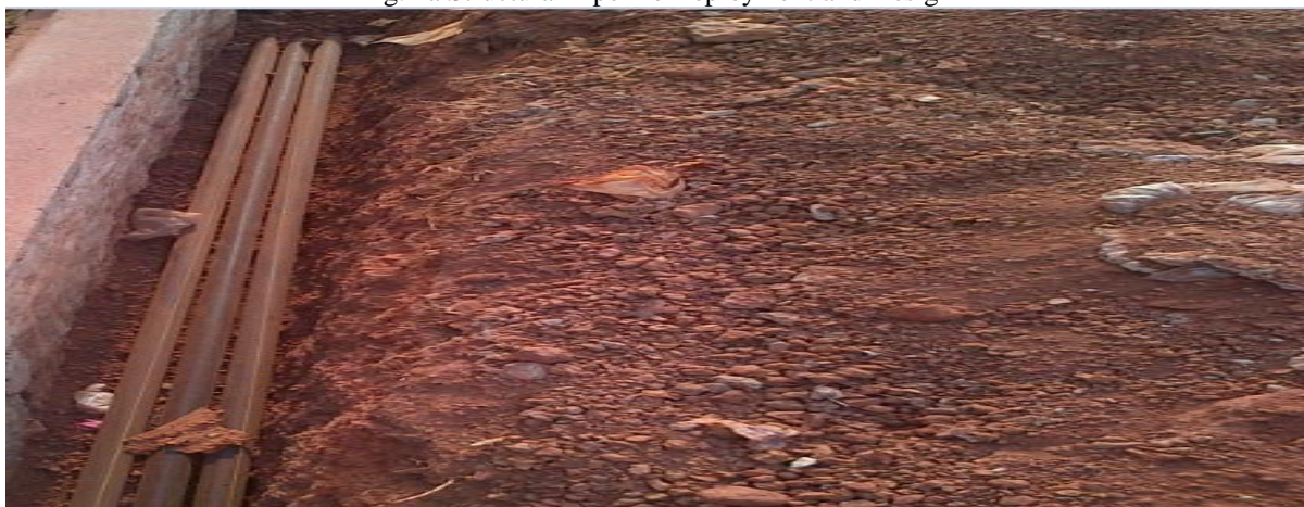
Fig. 1b Structural Pipeline Deployment and Design

On the fibre trench, the forces that are prevalent on the fibre is developed below. In the fibre, the stress on the wall cannot be equally distributed as the load varies, hence the tangential and radial forces are developed from engineering point of view.