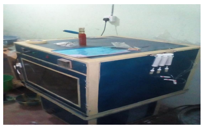
Plate 1: Experimental set up for batch digestion.

The readings of the gas production (ml), air pressure (mbar), gas temperature (37°C) and retention time were taken on daily basis throughout the period of the experiment. The gas produced was analyzed at least twice per week. The gas factor and the fresh mass biogas were calculated while the methane yields with the volatile solid biogas were determined on daily basis. The amount of gas formed were converted to standard conditions (273.15 K and 1013.25 mbar) and dry gas. The factor were calculated according to equation (3).