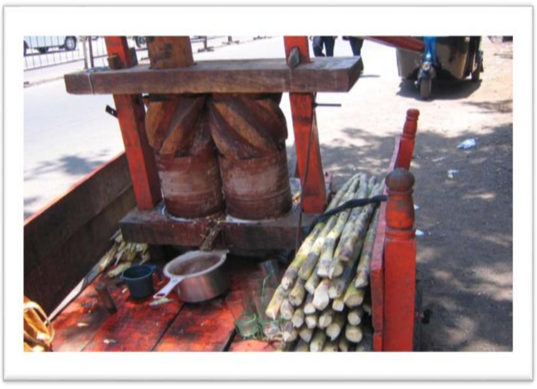
Figure 2.1: The Trapiche (Heiser, 2013)