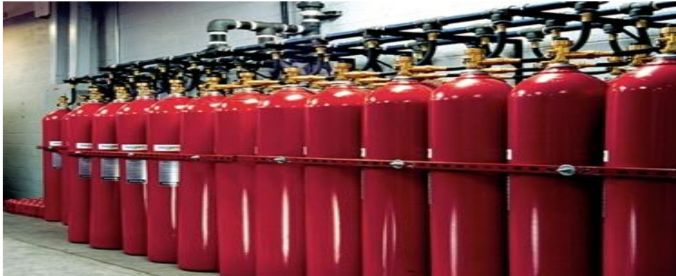
Figure 3: Gaseous systems onboard ships.

Recent development of modern gaseous firefighting systems utilizes jets, pipes and pressurised cylinders to disseminate the gas at a very high speed when dealing with fire on the ship as shown in figure 3.