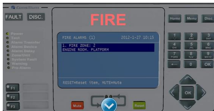
Figure 6: Fire alarm technology.

Due to increased building of extra larger vessels, IMO accentuate on the need for proper installation of fire detection and alarming systems to ensure early and rapid response to curb the fire event before it gets worse as shown in figure 6.