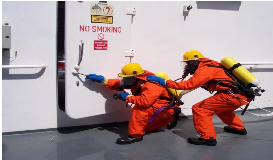
Figure 8: Fire drill.

Before the drill is conducted it is important to notify the individuals on board about it so as to avoid any fear and suspicion. The drill then commences with sounding of the fire alarms and loud communication followed by subsequent reaction speed to the incident area or location. The attack strategy implemented on the fire will depend on the scenario (source, size and the surrounding). Fire drills integrate various kinds of chaos to evaluate the response and ability of the crew to contain the situation. With regard to the drill, an assessment of whether the objective of the drill was attained can be performed so as to determine the lessons gained through the drill. This helps the concerned personnel to improve the standards of firefighting competence among the crewmembers hence perfecting the firefighting system on board ship (Bennett, 1964).