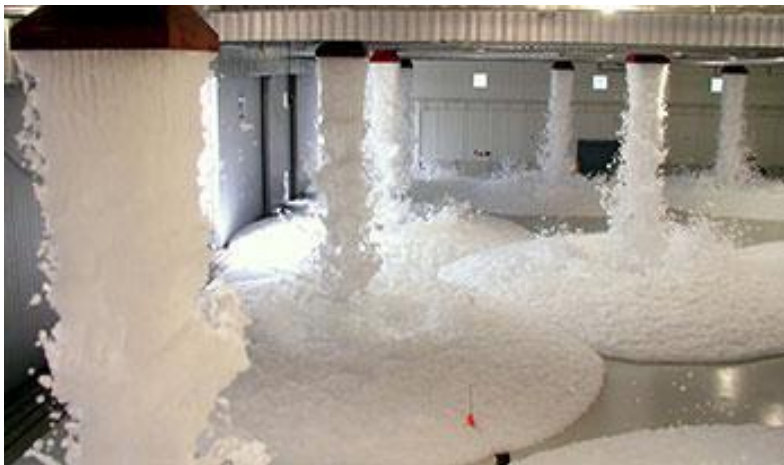
Figure 5: Compressed air foam is an effective fire compression system especially in chemical and petroleum industries.

For decades, firefighting has also witnessed the use of compressed air foam as an effective fire compression system especially in chemical and petroleum industries. Compressed air foam is produced by combining the following three elements: water, air and foam making agent. The procedure of making this foam involves mixing of the foam agent with water to create a foam solution. The generated solution is subjected to air through an appropriate aerating mechanism to produce the air bubbles. The suitable foam intensity is achieved when proper proportions of the three components are used as shown in figure 5.