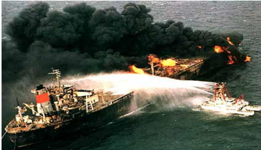
Figure 1: Tragedies of ship fire outbreaks that leads to loss of lives and properties.

shipboard fire. This meant that in case of fire event on the ship, the sea voyage depended on assistance from the on-shore (Maritime Training Advisory Board (U.S.). 1991). Despite this strategy being effective, it comes to appoint when the ship in danger cannot be visible from the land and no communication is possible and therefore persons on board have to cope with the fire incident hence this has led to more tragedy (loss of life and property) as shown in figure1. This therefore has ignited the need for adequate training of the ship crew, installation of firefighting systems and equipment to help harness any fire outbreak even when assistance cannot be offered from onshore (Maritime Training Advisory Board (U.S.). 1991).