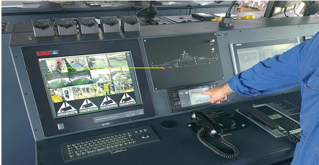
Figure 7: An example of a control room installed with modern systems and technology.

Modern technology of ship building design and configure video fire detection, flame images, smoke and fire recognition, monitoring which has improved and enhanced efficiency in fire suppression on ships today. An example of a control room installed with modern systems and technology for monitoring operation and activities on the ship so as to detect any fire incident is shown on the figure below.