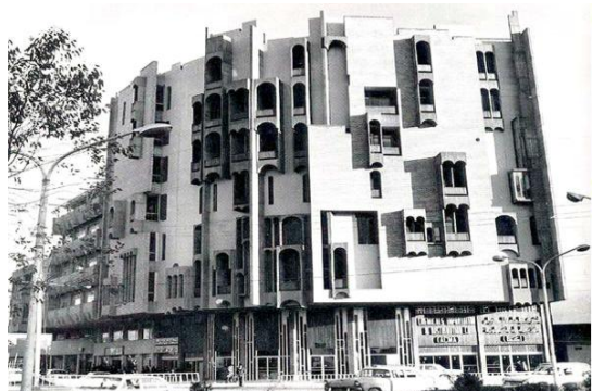
Fig.8. AL-Rashid Street in Baghdad -1961