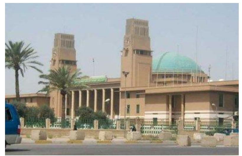
Fig.6. The central Train station in Baghdad 1949