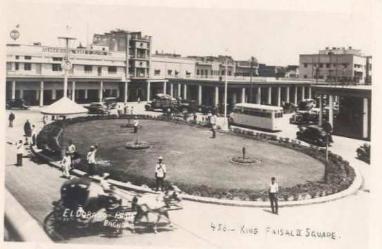
Fig.3. The Industrial Exhibition in Baghdad - 1932Fig.4. King Faisal II Square - 1944