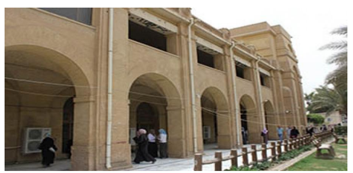
Fig.2.Aal Al-bait school – Baghdad 1922