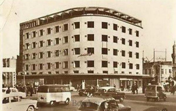
Fig.6. Al -Rafidain Bank – 1954 Fig.7. Merjan Building - 1954