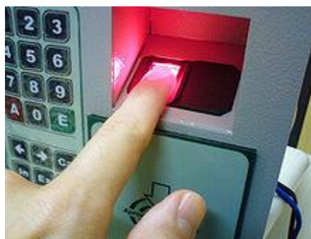
Fig. 2 Live scan devices

3-d fingerprint: Fingerprint picture acquisition is taken into consideration to be the maximum crucial step in an automatic fingerprint authentication machine, because it determines the very last fingerprint picture quality, which has a drastic impact on the general machine overall performance. There are specific kinds of fingerprint readers at the market, however the primary concept in the back of every is to degree the bodily distinction among ridges and valleys 11 .