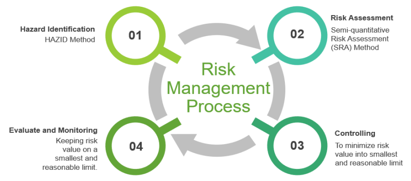
Fig.1. A stage of Risk Management Process

According to The Indonesian Ergonomics Association (IEA), there are three biggest hazards associated with working with a computer, for instance, non-ergonomic chairs, wrong work positions, and sitting for long periods of time. Therefore, we need to ensure that when working from home, potential hazards and risk are controlled by carrying out risk management. There are four stages in carrying out a risk management. A whole stepis shown in Fig.1.