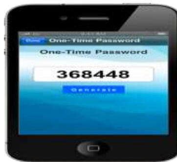
Figure 3. One time password on the internet