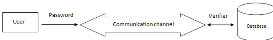
Figure 2. Password Model