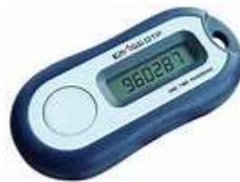
Figure 4. Hardware token