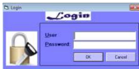
Figure 1. Password interface

The use of passwords for authentication is widely established as both implementers and customers accept them. However, password systems are susceptible to many attacks and attacks against passwords are less difficult to resist. Additional protections for the communication channel need to be added to protect the password, but this still does not prevent all attacks. Many security experts now regard passwords, by themselves, as insufficient for online authentication for anything other than low risk services.