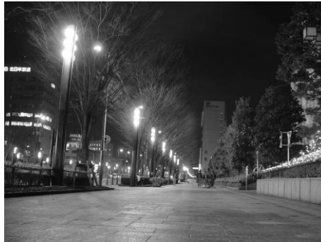
Figure 1 Sample picture