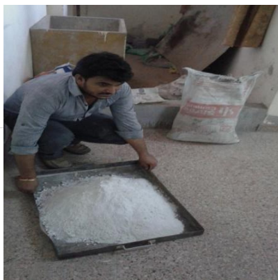
Fig:1 Marble slurry