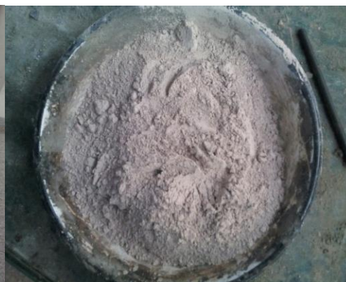
Fig: 2 Ground-granulated blast furnace slag