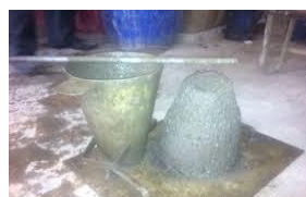
Fig.3 Slump test

WORKABILITY TEST RESULT: Design is done on the basis of slump 100mm-120mm and the slump was found 118 mm for M25 grade concrete many variations have seen while checking for slump of different concrete mixes.