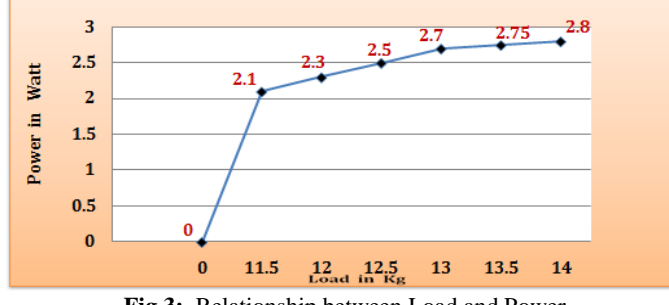
Fig.3: Relationship between Load and Power

The relationship between loads vs. Voltage is shown by the graph where load is presented on X axis and Voltage on Y axis. Now from the graph it is seen when the initial value of load is 11.5kg and Voltage is 3.12V. The load is increased from 11.5 kg to 12 kg and voltage from 3.12V to 3.42V and one by one load is increased with respect to voltage, There is one point where load is 12.5 kg and Voltage is 4.3V one loop occurred then again the load increased from 12.5 to 13 Kg and resulting voltage varies from 4.3V to 4.82V, again there is a linearity between load and voltage. Finally the relation between load and voltage is linear.