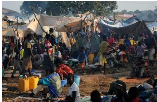
Figure 5 : Central African Refugees in the east of Cameroon

It is the same, the Chinese Ambassador to Cameroon Mr. Wei Wenhua the April 9, 2015, who presented the sum of 20 million CFA francs to the Cameroonian Minister of External Affairs Prof. Pierre Moukoko Mbonjo for food has more than 245,000 Central African refugees located in the east of Cameroon because of the crisis actuates Miss. [19]