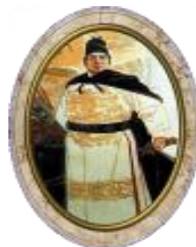
Figure 2: Zheng He.