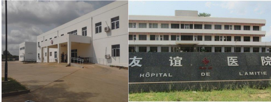
Figure 3: Hospital Elisabeth Domitien at Bimbo, inaugurate October, 04 2011.