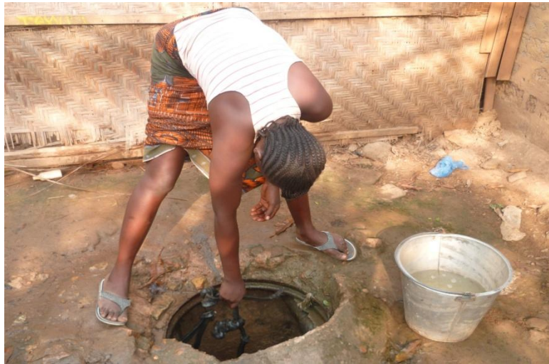
Photo 3: Water color and without the disorder

The wells in this area are in circular shape, surmounted by a drum cut in half and build a curb which consists of a few pieces of scrap metal recovery that is consolidated with the earth. This artisanal construction does not guarantee a true seal the wells, as shown in this figure below.