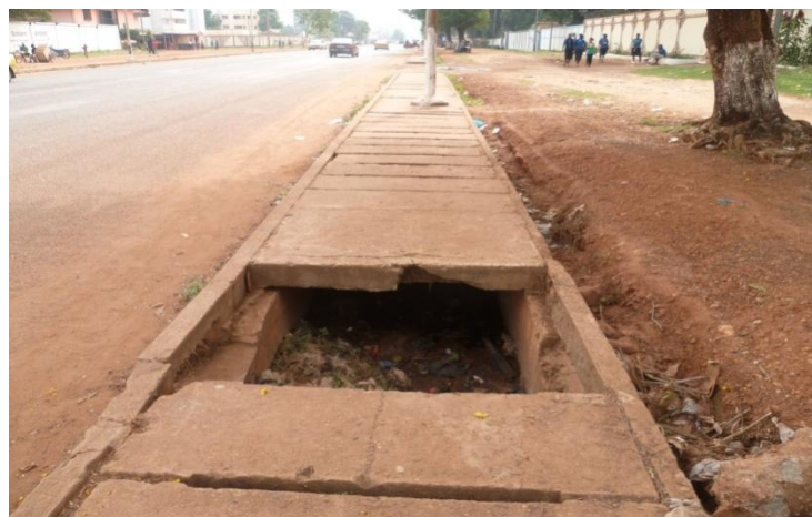
Photo 4: discharge channel wastewater from SAVEX

The image below shows the discharge channel wastewater from Savex (Figure 4)