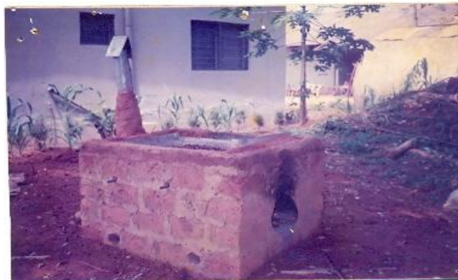
Plate 1: The Cocoa Beans Batch Dryer

The developed cocoa beans batch dryer and its general features are respectively shown on Plate 1 and Fig. 1. Below. It consists mainly of four major parts namely; drying platform, drying chamber, heating duct and air inlet holes. The drying platform (2) holds the beans during drying. It is made of stainless steel measuring 1900mm x 1000mm x 30mm. It has about 45% of its area perforated. The drying chamber (3) measuring 2340mm (length), 1340mm (width) and 920mm (depth) is made of mud brick walls which also help to reduce heat loss. The heating duct (flue) (4) enveloped by the drying chamber is where the fuel (wood) is burnt to heat the incoming air. One of its ends is opened for fuel loading, while the other end is connected to a chimney (1) through which the fumes is expelled. Also ashes from the burnt wood drops on the collection tray through perforated holes on the floor of the heating duct. Provision were made for adequate conventional heat transfer by the incorporation of two air inlet holes (6) of 150mm diameter each at the lower parts of the side. Bufflers and their slots (5) were also provided to properly direct the natural air towards the air inlet holes and the flue irrespective of the wind speed and direction. The thermometer/thermocouple holes (7) allow easy measurement of temperature in the drying chamber.