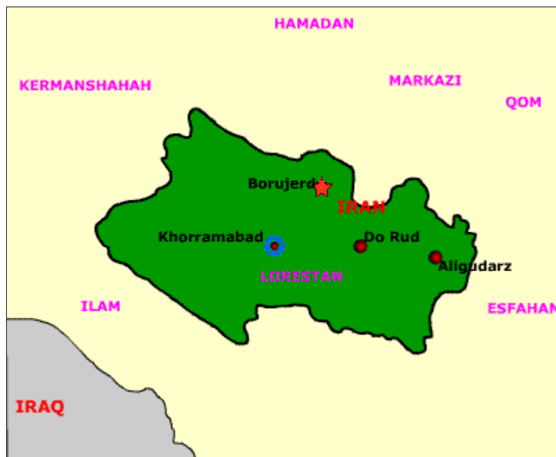
Figure 1: Lorestan province

as well as Isfahan Province and Kermanshah Province.