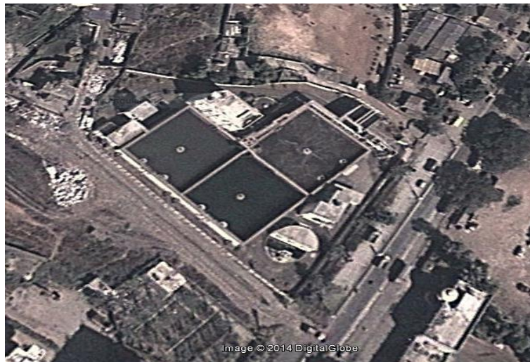
Figure 1: Google Earth Image of the Treatment Plant

Today, treating wastewater is generally a complex, multi-step industrial process. [1] The first step in a sewage treatment plant is generally some kind of mechanical treatment, where large objects and heavy materials are removed. The mechanical treatment may consist of a screening chamber (coarse and fine screening) and a degritor. To remove soluble organic matter and possibly also nitrogen from the wastewater, biological treatment is often the second step and followed by disinfection unit (Chlorine contact tank)