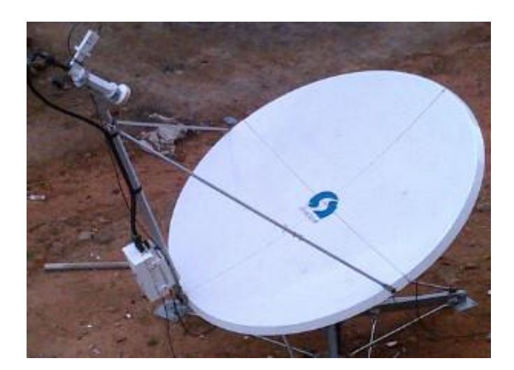
Figure 4.1: 1.2M C-Band Satellite Antenna for Outdoor STV Broadcast [22]