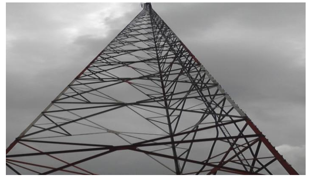
Figure 3.0: A 450ft Mast housingSTV UHF-30 Antenna [22]

C. The Terrestrial Standard : Terrestrial broadcasting has been the mainstay of local broadcasting especially in the analogue mode. It suffers from less attenuation when compared to satellite broadcasting but its channel is not as secure as the cable channel. It is arguable that terrestrial broadcasting in the analogue mode holds attraction in areas where affording set top boxes and (or) satellite dishes is beyond the financial capacity of locals. Figure 3.1 below is a typical mast housing Silverbird Terrestrial TV antenna transmitting on channel 30 UHF Awka, Nigeria.