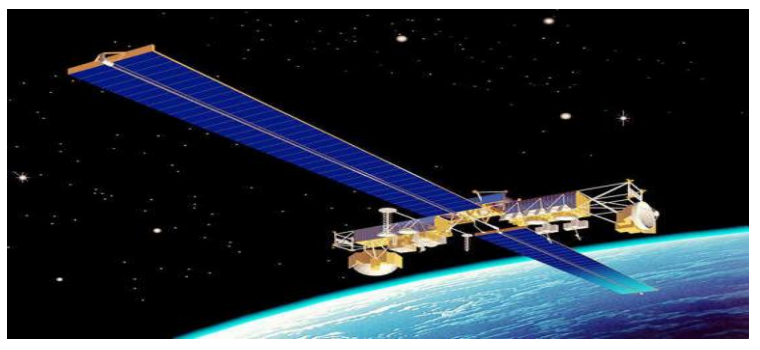
Figure 4.0: Television Satellite in space [23]

C. Technology : Satellites used for television signals are generally in either naturally highly elliptical (with inclination of \pm -63.4 degrees and orbital period of about 12 hours, also known as Molniya orbit) or geostationary orbit 37,000 km (22,300 miles) above the earth's equator as shown in figure 4.1 below. Satellite television, like other communications relayed by satellite, starts with a transmitting antenna located at an uplink facility. Uplink satellite dishes are very large, as much as 9 to 12 meters (30 to 40 feet) in diameter. The increased diameter results in more accurate aiming and increased signal strength at the satellite. The uplink dish is pointed toward a specific satellite and the uplinked signals are transmitted within a specific frequency range, so as to be received by one of the transponders tuned to that frequency range aboard that satellite. The transponder 'retransmits' the signals back to Earth but at a different frequency band (a process known as translation, used to avoid interference with the uplink signal), typically in the band (4–8 GHz) or Ku-band (12–18 GHz) or both. The leg of the signal path from the satellite to the receiving Earth station is called the downlink.