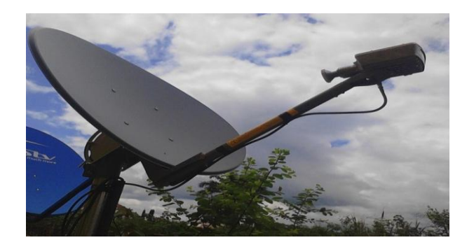
Figure 2.0: Ka Band Antenna

The Internet itself is the last and probably most important interface in the context of data communications. Organizations in the private and public sector have either converted their data communications over to the Internet Protocol, or are in the process of doing so. The interface that is growing to dominate the data world is the simple RJ-45 modular jack associated with the Ethernet standards, 10baseT and 100baseT. Higher rates than 100Mbps demand Gigabit Ethernet or the optical speeds of the Synchronous Digital Hierarchy (e.g., OC-3, OC-48). Such speeds are presently beyond a practical HSA service from currently operating C and Ku band GEO satellites [8]. This could be the domain of the coming generation of broadband satellites employing Ka band spot beams and on-board processing as shown in figure 2.0 below.