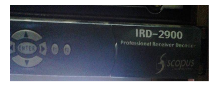
Figure 2.1: Scopus IRD 2900 Professional Receiver Decoder [23]

A. Broadcast, Multicast and Unicast : Terrestrial networks, including the Internet, are effective for point-topoint transfer of digital media and content. Multicast service over the Internet must employ several point-topoint links to emulate a broadcast system, and therefore has difficulty assuring timely delivery of content to all receivers. A broadcasting station from a local television tower or GEO satellite affords timely delivery of content with a consistent bandwidth. Guaranteeing delivery is usually less of a problem because receivers are designed to directly play the content (a local recording device can allow later playback, if desired).Included in the DVB standard is a data transfer capability called Internet Protocol Encapsulation (IPE). This allows a single broadcast carrier to transfer both television programming and Internet content on the same transport stream. At the subscriber end, the carrier is detected by an integrated receiver decoder (IRD) that extracts the data and delivers it to a local PC or LAN as shown in figure 2.1 below.