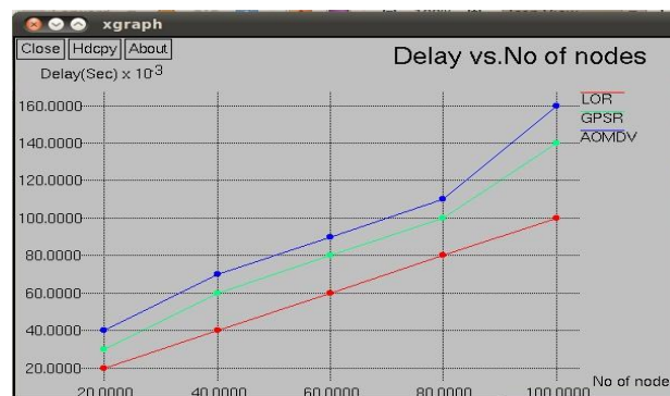
Fig.3. End to End Delay Comparison Graph

End to End Delay will increases as amount of participating node increases. LOR has lower delay compared with others as shown in Fig.3