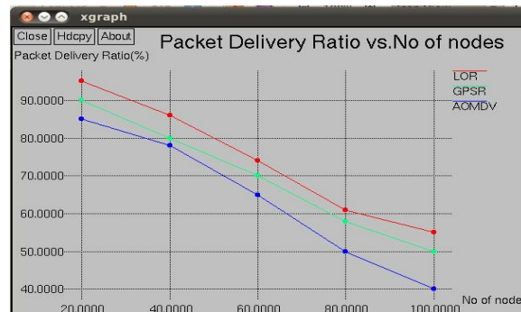
Fig.1. PDR Comparison Graph