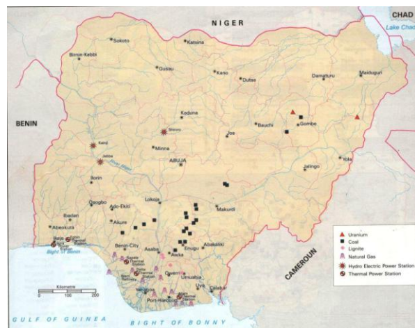
Fig. 1: Map of Nigeria showing its Physical Feature Fig. 2: Surface drainage Rivers