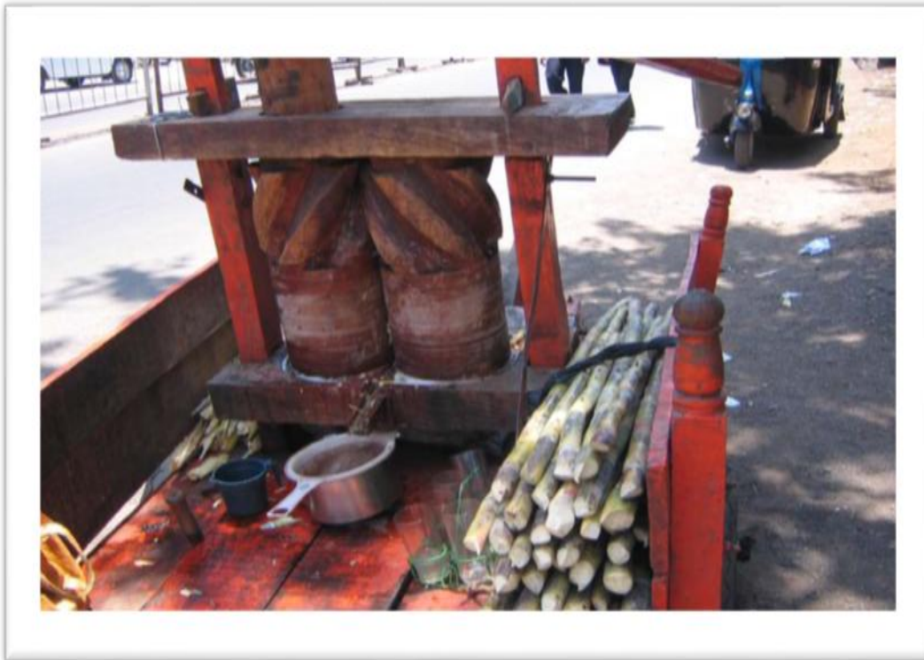
Figure 2.1: The Trapiche (Heiser, 2013)