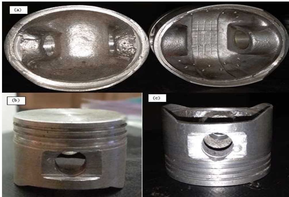
Figure 1: (a) imported and machined cast piston (b) inverted Cast piston (c) upright cast piston

The reinforced and unreinforced cast pistons were fettled, placed on a lathe and machined to standard specification of Jincheng motorcycle piston. The pistons after machining were subjected to surface finish and dimensional accuracy by touch, visual inspection, and vernier calliper. The pictorial view of the cast machined piston is shown in figure 1 below.