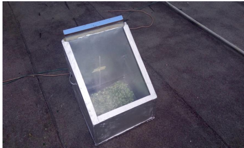
Plate 1: Oven Drying of the Moringa Leaves in Progress