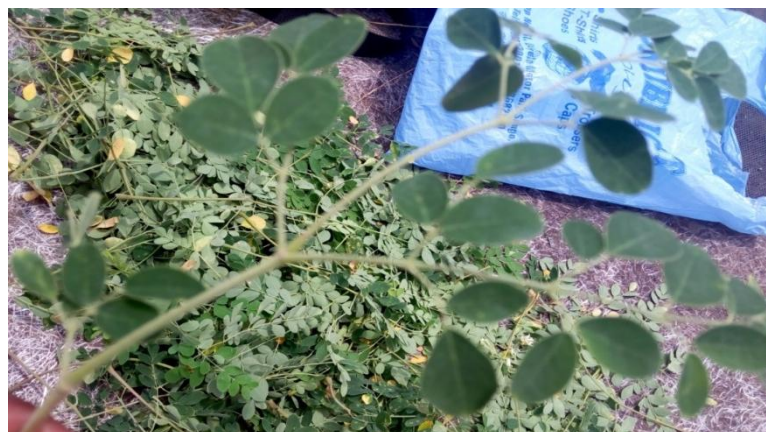
Plate 2: Moringa Leaves