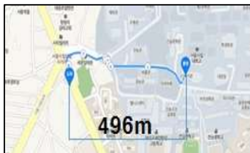
Fig 1 Assuming initial access to bus stop