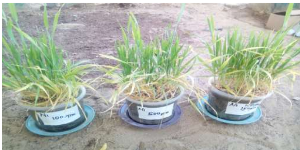
Figure 4: Triticum. aestivum in the Experimental Pots Spiked with Different levels of Ni