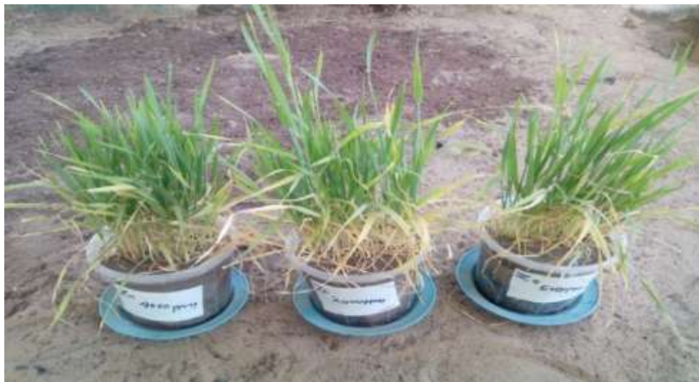
Figure 2: The Grass of T.aestivum Spiked with different levels Zn in Experimental Pots