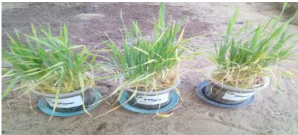
Figure 3: Triticum aestivum in the Experimental Pots Spiked with Different levels of Co