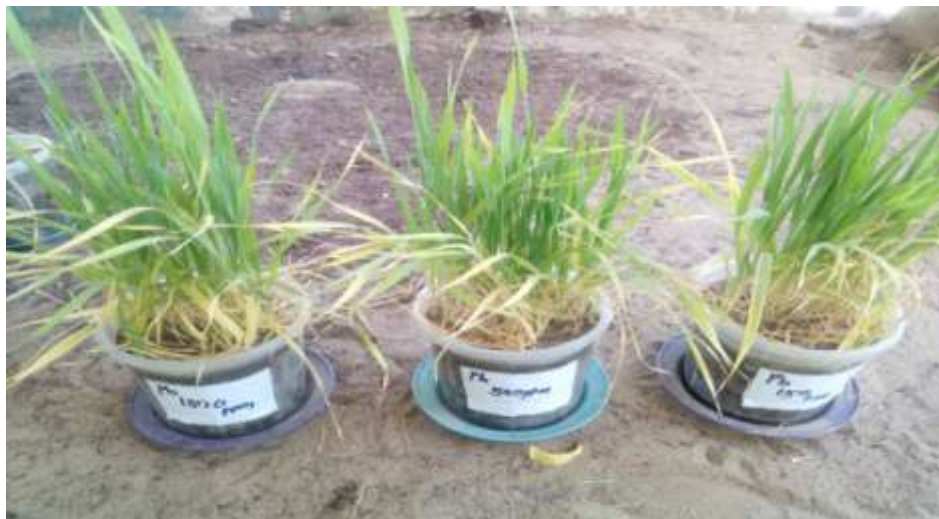
Figure 5: T. aestivum in the Experimental Pots Spiked with Different Levels of Pb