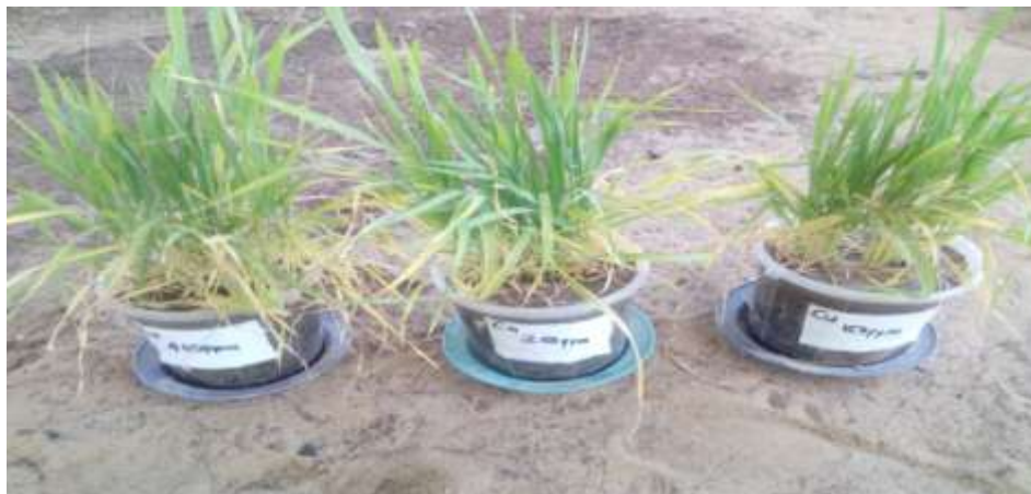
Figure 6: T. astivum in the Experimental Pots Spiked with Different Levels of Cu