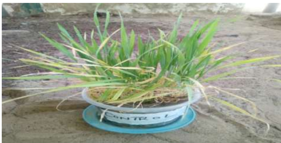
Figure 7: T. astivum in the Control Pot of the Experiment