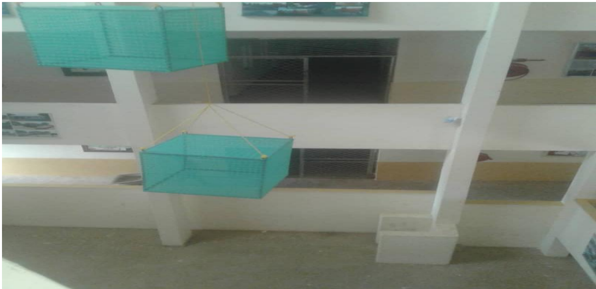
PlateIV: Ramp passes through different floors Researcher Field Work(2023)

Faculties building on the ground floor, first floor and second floor have a free step (no change of levels) on all the entrances to faculty facilities such as classes, offices, seminar rooms, conference room, and student archives. Thus, it is easier for both able and disabled users.