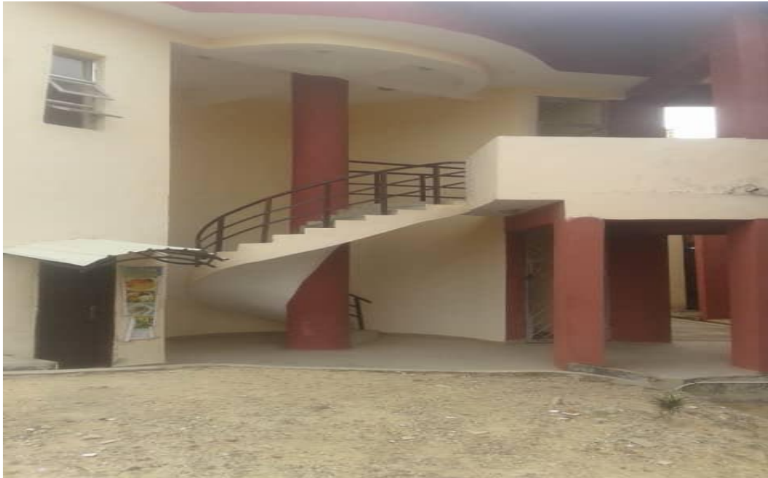
Figure V: Staircase for vertical circulation Researcher Field Work(2023)