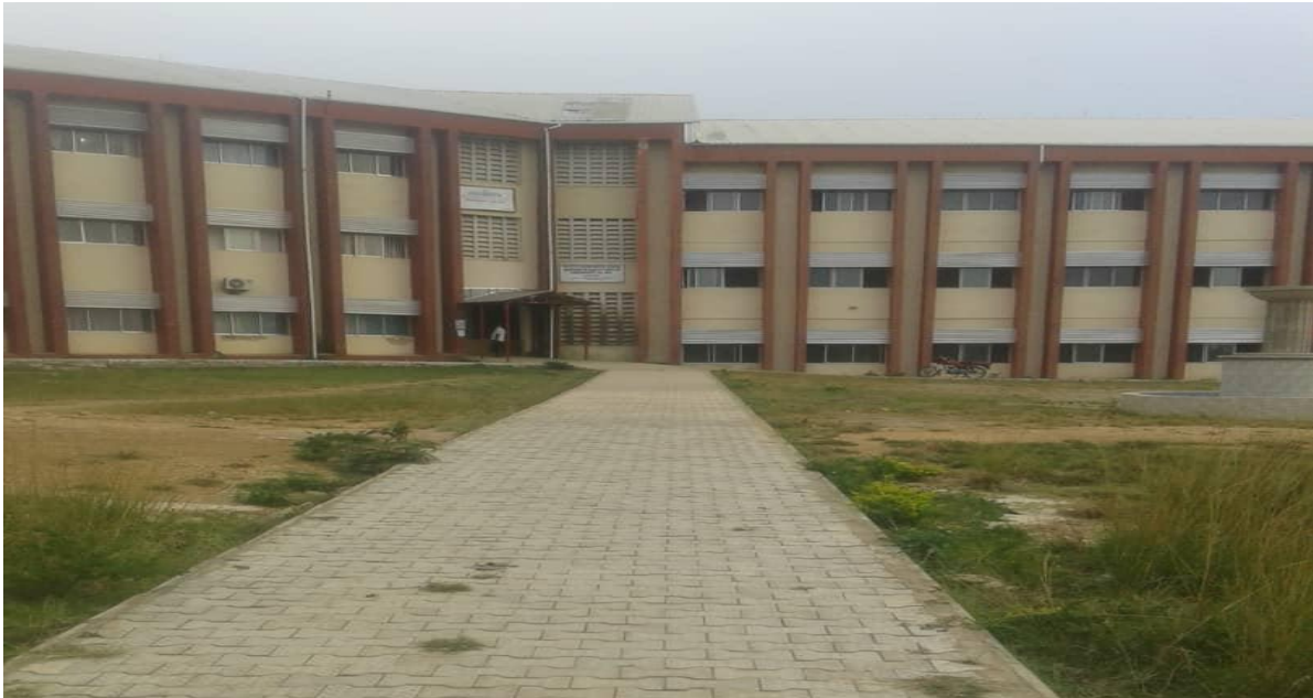
Plate II: Approach view with central entrance to the faculty of environmental Science building university of Jos Source: Researcher Field Work (2023).