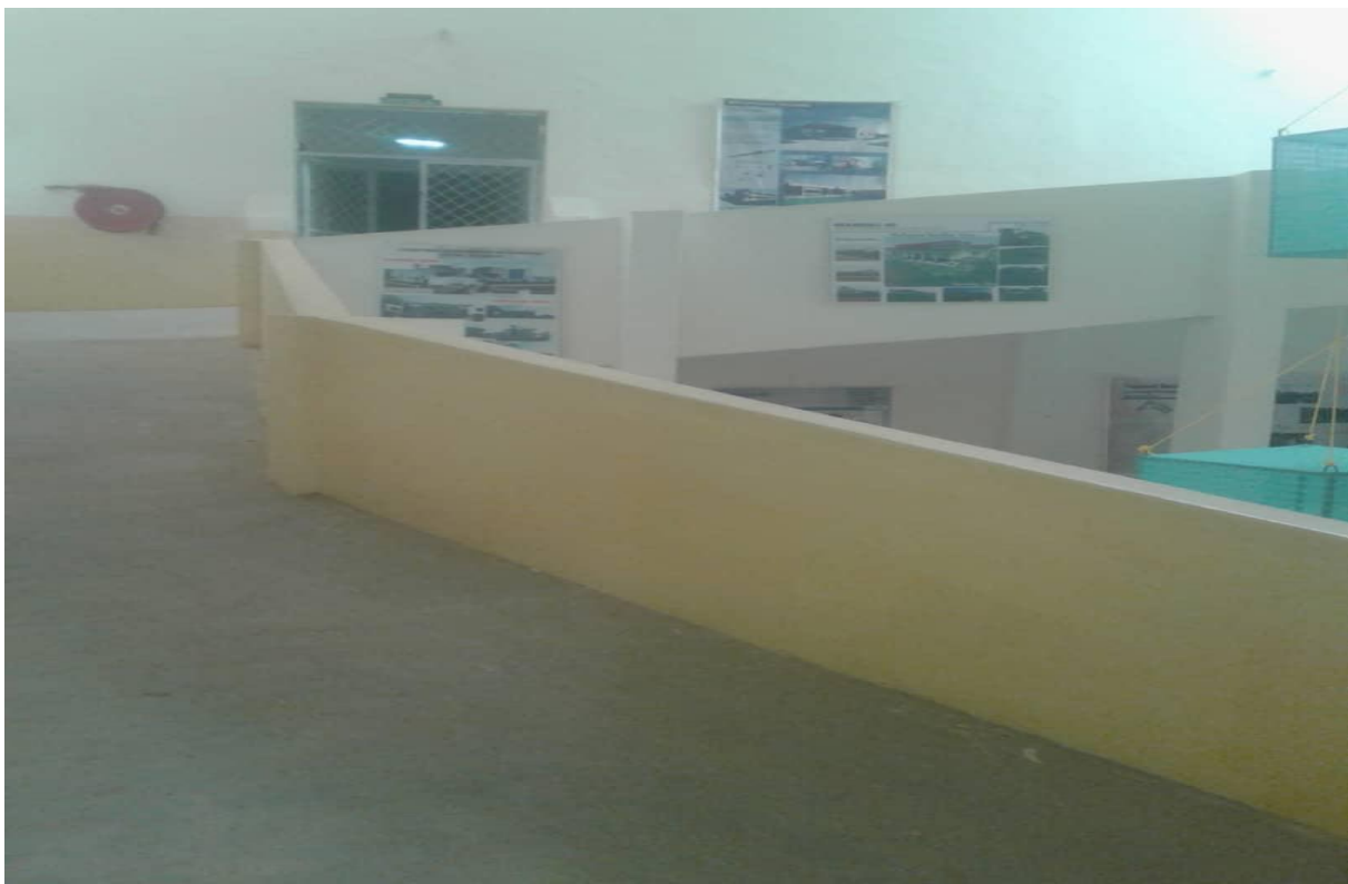
Figure III: Ramp provided for vertical access to the building Researcher Field Work (2018)

The faculty block is divided into three floors of which both ground and first floor have classes of undergraduate and post graduate studies while the third floor have HODs offices, conference rooms, seminar rooms, data room, classes, and studios. The faculty building has two (2) central ramps that link all the classes and administrative block with different exit on corridor and also there is stair case positioned at both ends of the faculty Building.