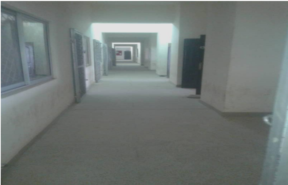
Plate VI: Corridor for horizontal movement Researcher Field Work(2023)

The entire link ramp and corridors of ground and others subsequent floors are adequate to carry a lot of users for easy movement.