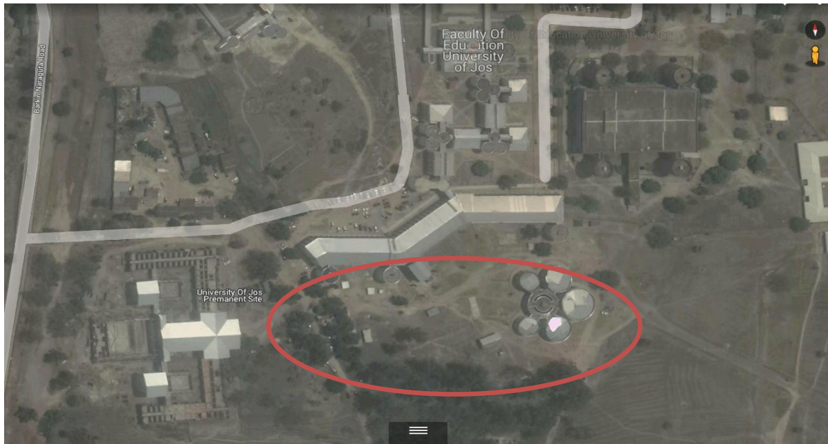
Plate I: Layout of University Jos, Faculty of environmental science

departments are situated close to the main faculty which comprise of building, quantity survey, geography and planning.